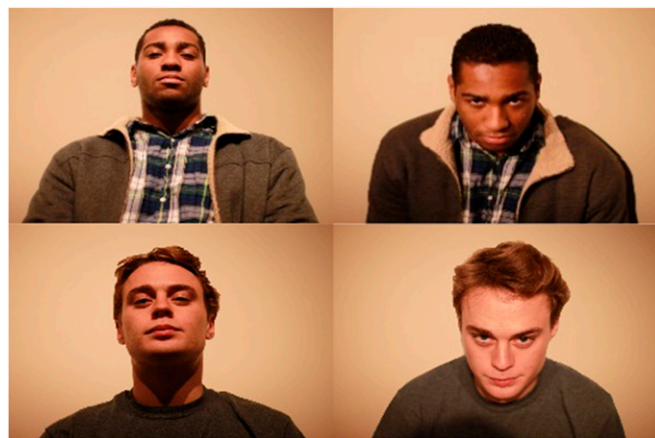
Fig. 3. Two of the 16 male students whose photographs were used in study 2. The men in the photographs on the left (looking down) were perceived as taller than the same men in the photographs on the right (looking up).

BaBT. Participants answered questions adapted from the General Social Survey ( gss.norc.org ). We used these questions because they are less confounded with political beliefs than other scales (43) and directly target stereotypes of Black threat. Participants provided their attitudes toward Black, Hispanic, and White people on seven-point bipolar scales for “nonviolent/violent,” “nonthreatening/threatening,” “nonaggressive/aggressive,” and “not dangerous/dangerous.” Questions about Hispanic